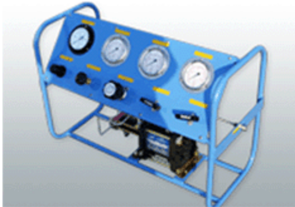
# BOOSTER DWG